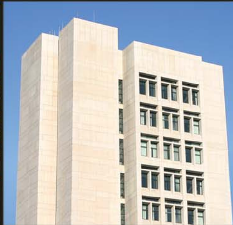
Westchester Courthouse, NY 220,000 Square Ft of GFRC Cladding