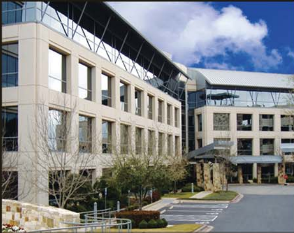
Four Barton Skyway Austin, TX 40,000 Square Ft of GFRC Cladding