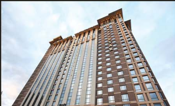
Ameristar Casino Blackhawk, CO 150,000 Square Ft of multi color GFRC Panels