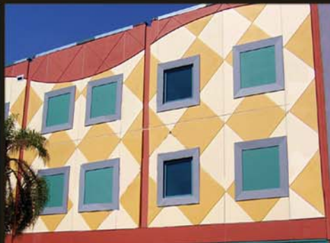
Miami Children's Hospital, FL 90,000 Square Ft of GFRC Panels